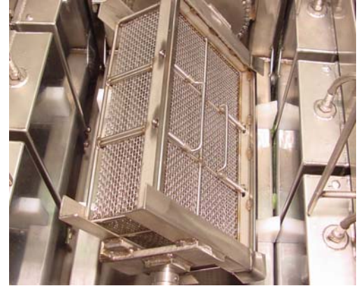
Ultrasonic Cleaning with Basket Rotation and Vertical Agitation