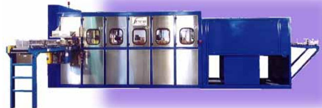
Standard 5 Tank with Basket Rotation & Rotating Dryer