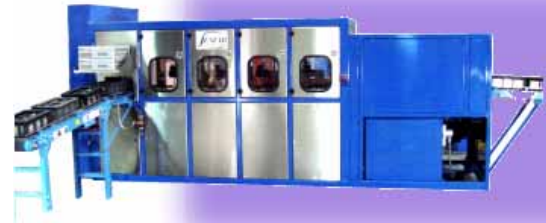
Standard 4 Tank with Basket Rotation & Rotating Dryer