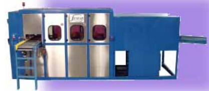
Standard 3 tank with Dryer