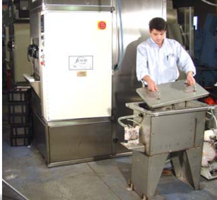
Mini Coalescor installed on a JENFAB LeanClean 360 Rotating Basket Cell Washer

Same efficient design as our 5, 10, & 20 gpm models