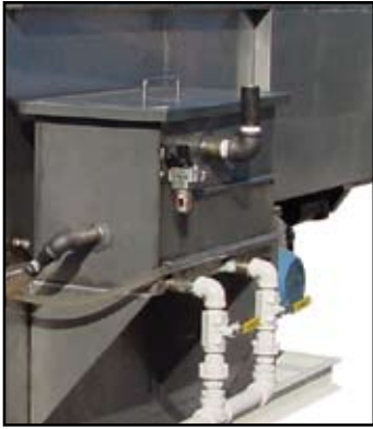
LJ Shown with Optional Coalescing Oil Separator installed