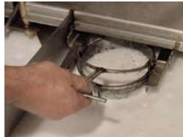
Optional Chip Strainer Baskets easily lift out and keep chips out of tank