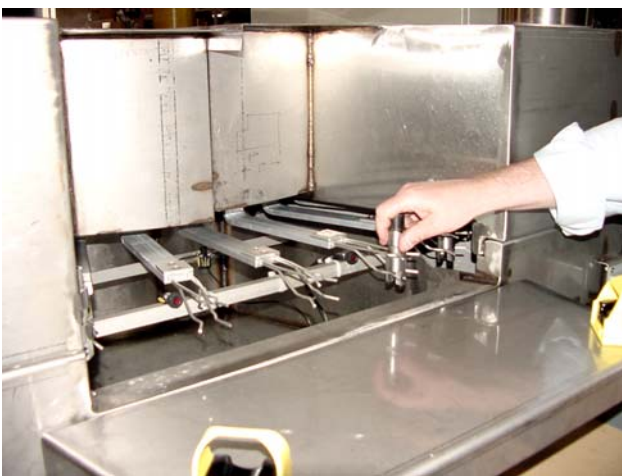
Pick and Place / Robotic / Manual loading