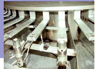
Quick change over

Call: 860/828-6516 Or visit www.jenfab.com