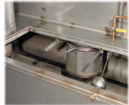
Large tank access doors and lift out stainless steel chip baskets