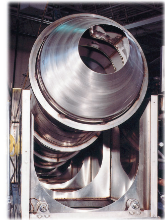
View of exposed drum. Top of drum enclosure and drum are easily removed