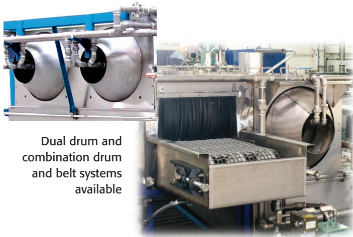
Dual drum and combination drum and belt systems available