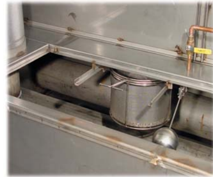
Large tank access doors and lift out stainless steel chip baskets