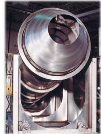
View of exposed drum. Top of drum enclosure and drum are easily removed