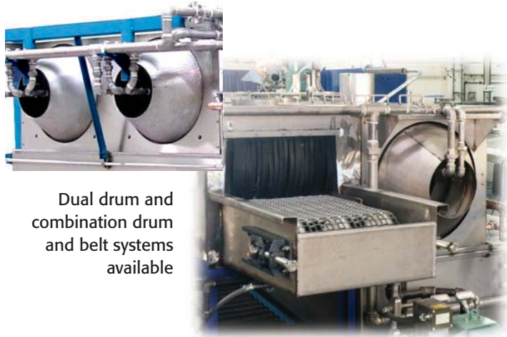
Dual drum and combination drum and belt systems available